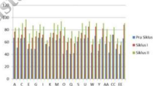
Figure 2. Comparison of student scores in the speaking skills aspect of students in pre-cycle, cycle I, and also cycle II.

Details of the comparison of student scores on the aspect of speaking skills in pre-cycle, cycle I, and also cycle II class IA SDN 2 Percobaan Yogyakarta can be seen in Figure 2 below.